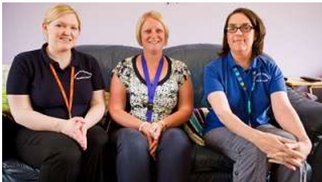
The children's community nursing team at Cambridgeshire Community Services NHS Trust has been announced as the winner of NHS England's 6C's Live! September Story of the Month